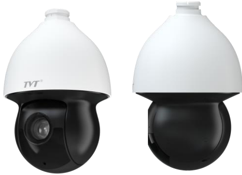
TD-8543IE3N(PE/25M/AR30) TD-8543IE3N(PE/32M/AR30) TD-8543IE3N(PE/40M/AR35)